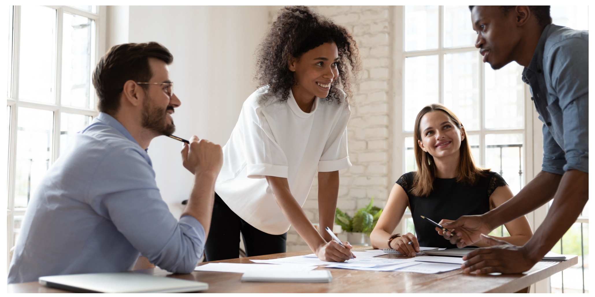
Updated: April 2024