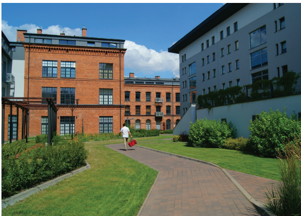
Across a portfolio of buildings, smart sensors integrated with an IoT platform facilitate building operations while enhancing the occupant experience.

In the same conference room, imagine a luminaire-mounted smart sensor. The sensor can detect motion and monitor occupancy over time, creating a precise record of when the room was occupied, for how long and by how many people. An asset-tracking sensor reports what equipment is in the room and records its usage through the day. These two data streams are delivered to space utilization software that generates a dashboard of the room's daily activity.